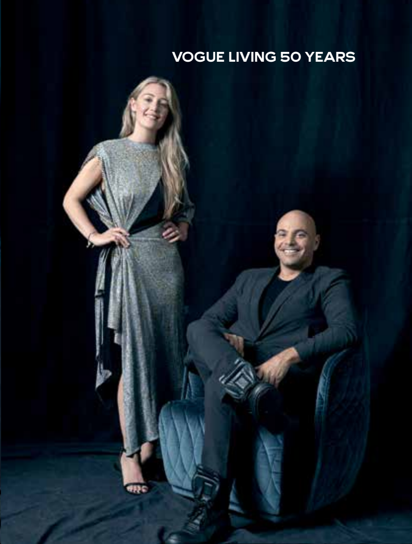
CLOCKWISE FROM TOP LEFT: Cherner wood base stool and Moroso Renondo armchair by Patricia Urquiola, both as before; Tom Dixon Wingback chair, $7238, from Dedee; Topos Workshop Curve stool as before; GTV Cirque stool by Martino Gamper, $1540, from Space Furniture; Italian two-seater sofa, as before; Walter Knoll Healey lounge, $4061, from Living Edge; Tom Dixon Wingback chair, as before. Details, last pages.