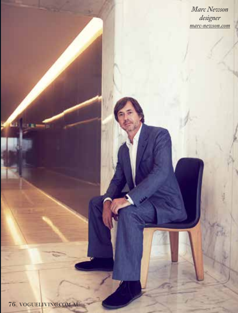
Marc Newson designer marc-newson.com