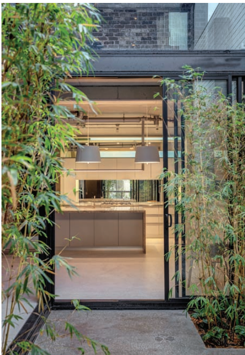
opposite —A privacy vestibule separates the entrance from the house proper. above —The palette of the contemporary kitchen is soft grey in keeping with the polished concrete floor and white painted walls in this area. left —Looking back to the kitchen from the outdoor courtyard